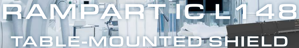
TABLE-MOUNTED RADIATION PROTECTION